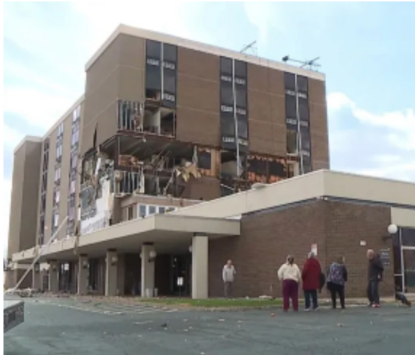
The aftermath of the explosion at the Phoenix House apartments in Austintown, Ohio.

Saturday, Nov. 22, 2025